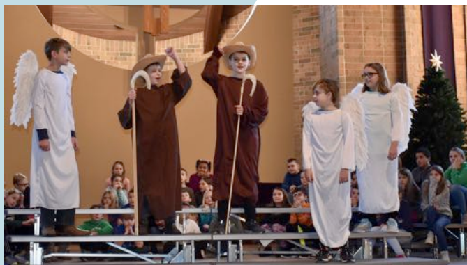
6 th grade rehearses a scene from Miracle at Midnight